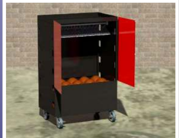
BASKETBALL CART 32"D X 48"W X 75 3/4 " H

The hybrid football equipment storage cart was designed to store 28 helmets and 26 pairs of shoulder pads. The cart comes with a vinyl cover or lockable doors. It also comes with a hinged top shelf tray to make equipment loading and unloading easier. Cart rolls on 8" lockable wheels.