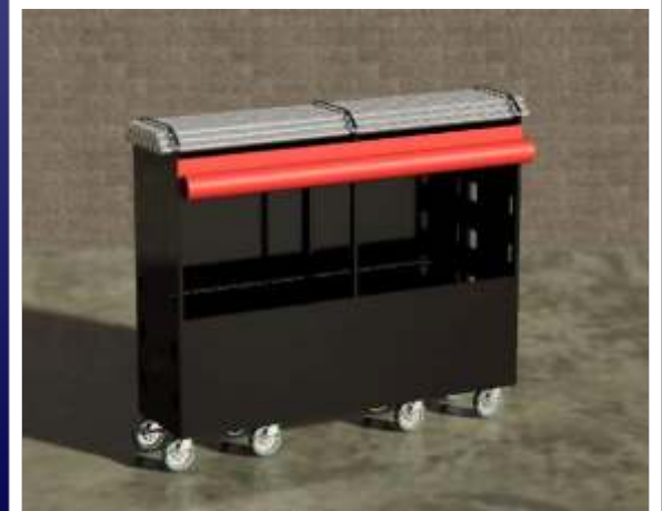
SOCCER CART Dimensions are 24" D x 90" W x 70" H

Mobile basketball cart designed to store 30 basketballs and all team uniforms. Tray top storage of coolers, etc. Snap-on waterproof vinyl cover or lockable doors included for equipment protection. Cart rolls on 8" lockable wheels.