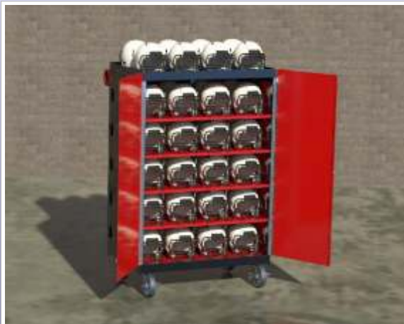
HELMET CART 32" D X 48" W X 68" H

Mobile helmet cart is designed to store 48 helmets. Snap-on waterproof vinyl cover or lockable doors included for equipment protection. Cart rolls on 8" lockable wheels.