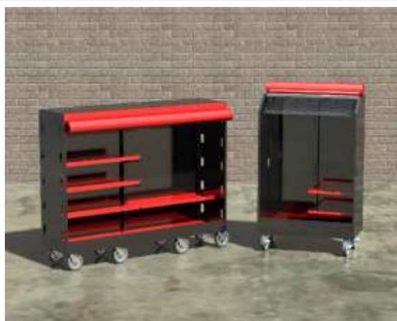
STANDARD GARMENT CART 24" D x 90" W x 66 1/2" H 4' GARMENT CART 24" D x 48" W x 76 1/2" H

Mobile helmet cart is designed to store 48 helmets. Snap-on waterproof vinyl cover or lockable doors included for equipment protection. Cart rolls on 8" lockable wheels.