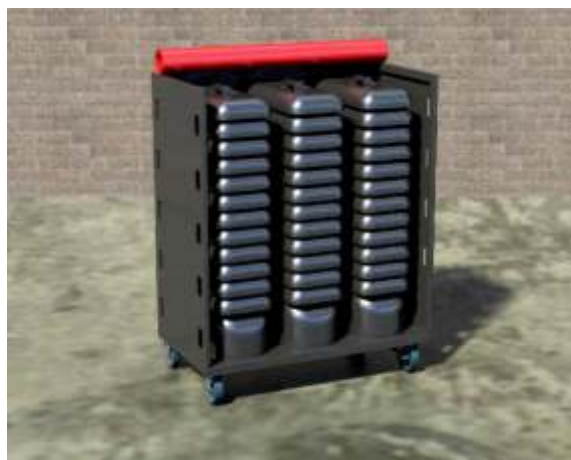
SHOULDER PAD CART - Youth Dimensions are 32" D x 48" W x 68" H